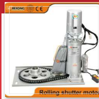
Rolling Shutter Motors