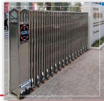
Retractable Sliding Gates