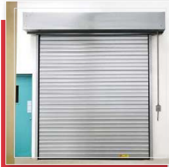
Gear Operated Rolling Shutters