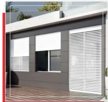
Aluminium Rolling Shutters