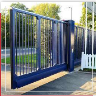
Cantilever Sliding Gates