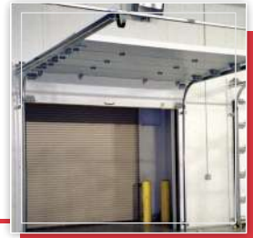
Overhead Sectional Doors