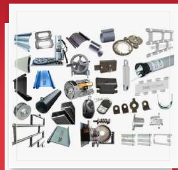
Rolling Shutter Motor Spares