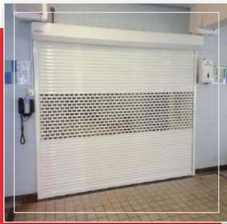
Grill Rolling Shutters