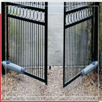
Automatic Swing Gates