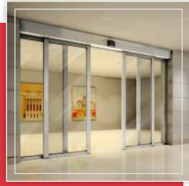
Automatic Glass Sliding Doors