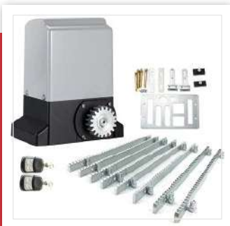
Sliding Gate Motors and Spares