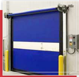
High speed Roll up doors