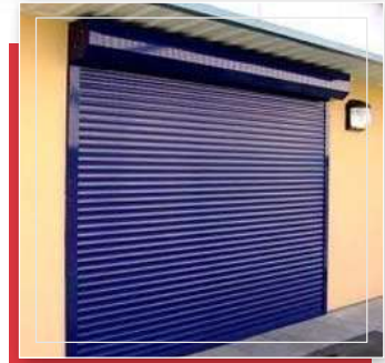
Push And Pull Rolling Shutters