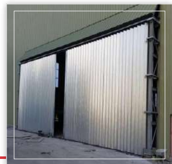
Sliding Shutter Gates