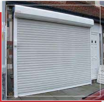
Motorized Rolling Shutters