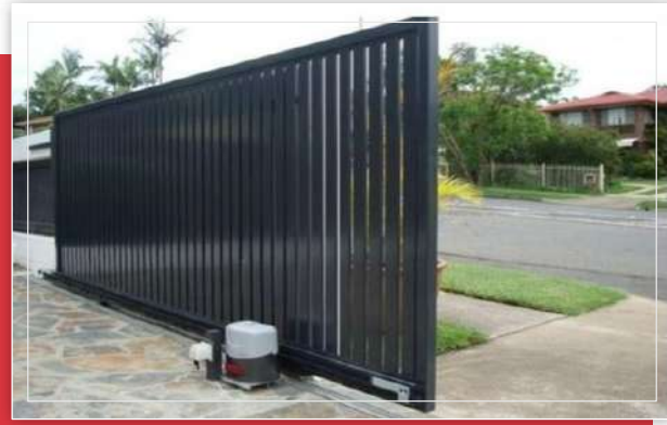
Automatic Sliding Gates