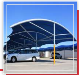
Car Parking Shed