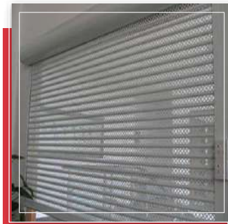
Perforated Rolling Shutters