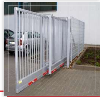
Telescopic Sliding Gates