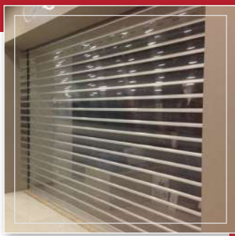
Polycarbonate Rolling Shutters